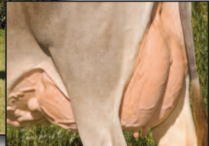
Sun-Made GB PLT Pretzel ET "2E93/94MS"

Passion Sells in Kentucky National Sale Friday, April 6