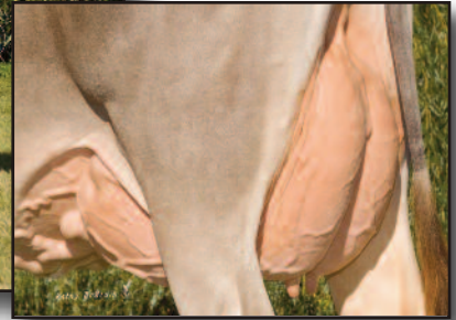
Sun-Made GB PLT Pretzel ET "2E93/94MS"

Page Sells in Eastern Breeders' Sale October 20 in Cobleskill, NY